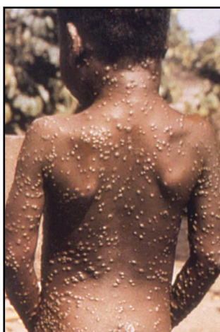
Aigwaigwa na emukule/akwan