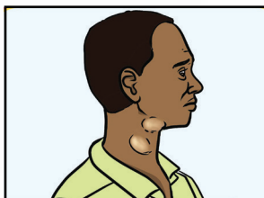
Abuonor na angarwei (iporotoi)