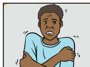
Obunyifu bwo mubiri