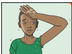
Ohubaala hwo mubiri